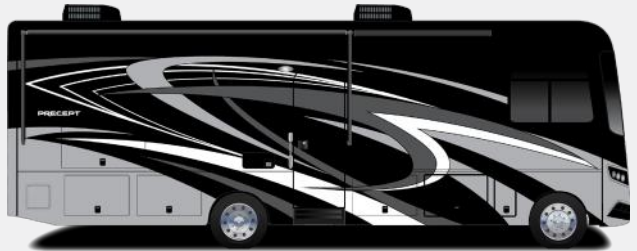
Denali Full-Body Paint