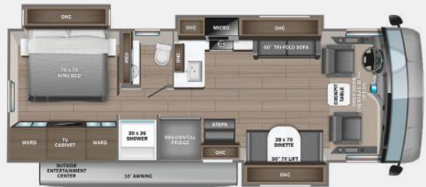
31UL OPTIONS: A, B