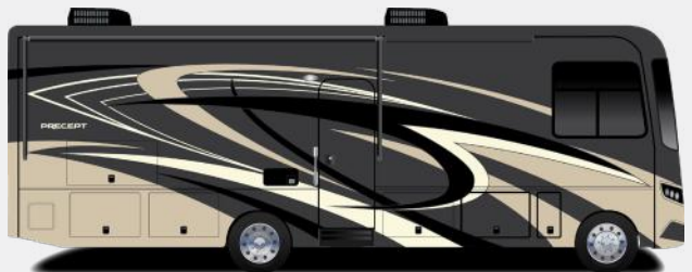
Everest Full-Body Paint