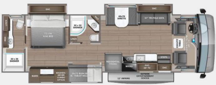
36A OPTIONS: A, B