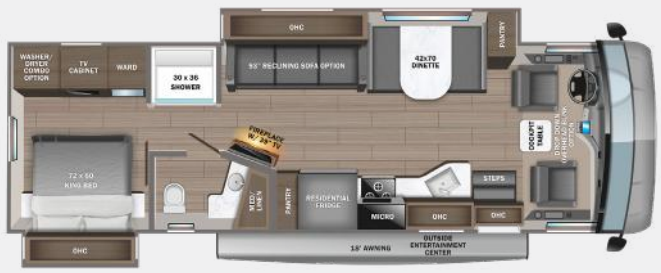
34B OPTIONS: A