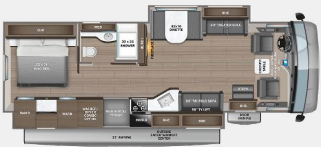
34G OPTIONS: A