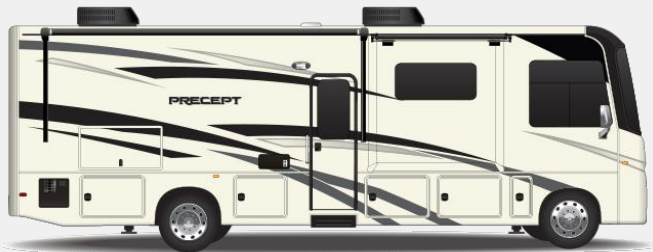
Standard Graphics Package