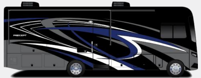
Alpine Full-Body Paint